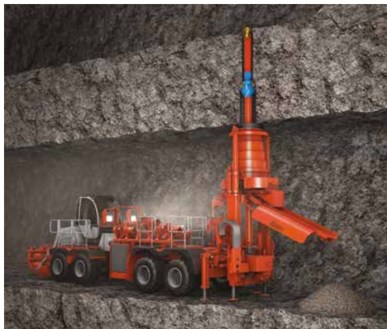
Rhino 100HM is a total solution for production drilling. One man operation is safe, productive and efficient

Jorma Kinnunen, the rig operator mentions that: “the planned change-over time of one to two hours from