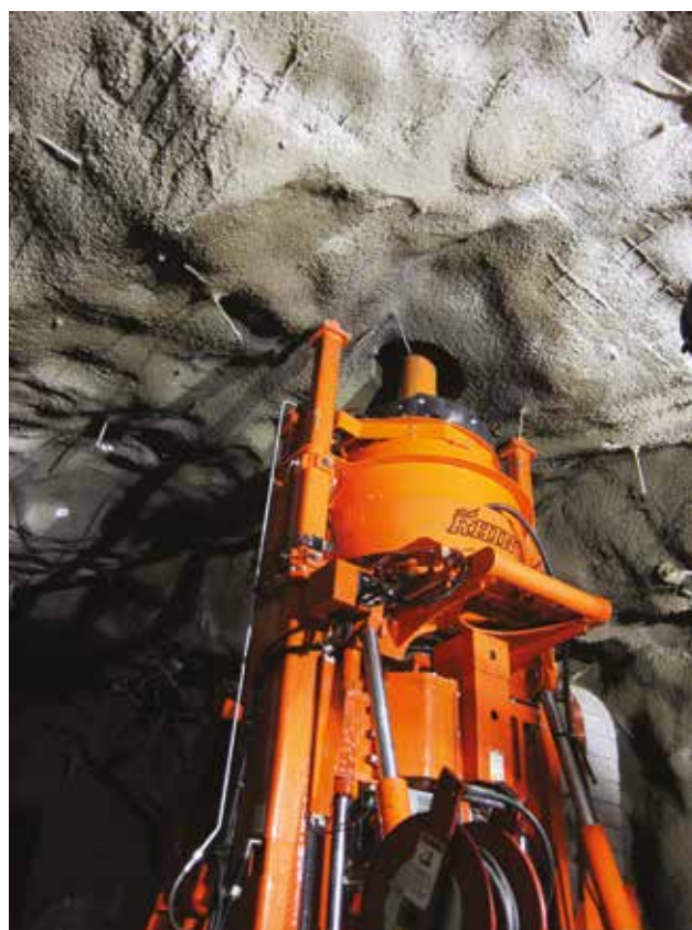
Once the slot raise slot has been completed, the equipment can be dismantled and moved to the next drill site

Nowadays, there are several methods traditionally employed in mines to produce these slot raises: long-hole rigs, manual drilling methods, and even conventional raise boring to name but a few. Naturally, the chosen method depends also on the mining method being employed. A common denominator is often the complexity of the mining process, with multiple step operations being the least efficient. However, if you consider this function to be at the centre of any production initiative, then any improvement should be well received and immediately contribute to "bottom line" advantages.